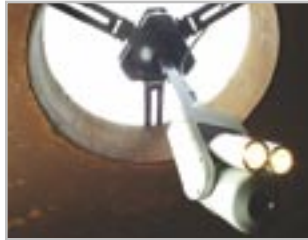
▼ Oil Refinery Vessel Inspection