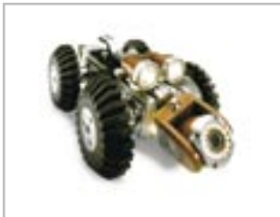
ROVER® Steerable robotic crawlers