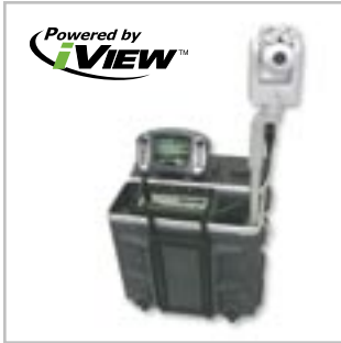
CA-ZOOM® PTZ Series High-power zoom (up to 300:1) with joystick-controlled color pan-tilt-zoom camera and color VGA display