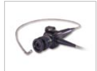
Flexible Fiberscopes High-resolution images. Available in many diameters