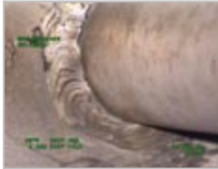
▼ Pharmaceutical Tank Weld Inspection