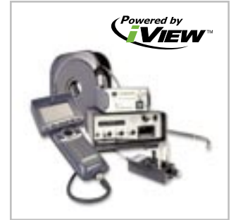
LongSteer® VideoProbe® Up to 100 ft long, articulating, small-diameter video borescopes