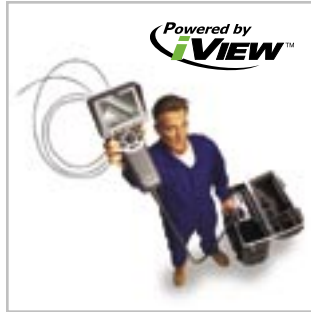
VideoProbe® XL PRO™ Advanced portable, high-resolution, digital video borescopes with measurement