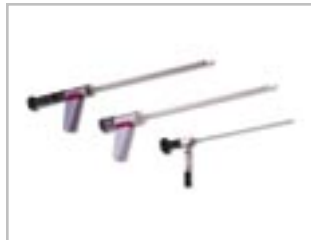
Rigid Borescopes Durable insertion tubes with superior image quality